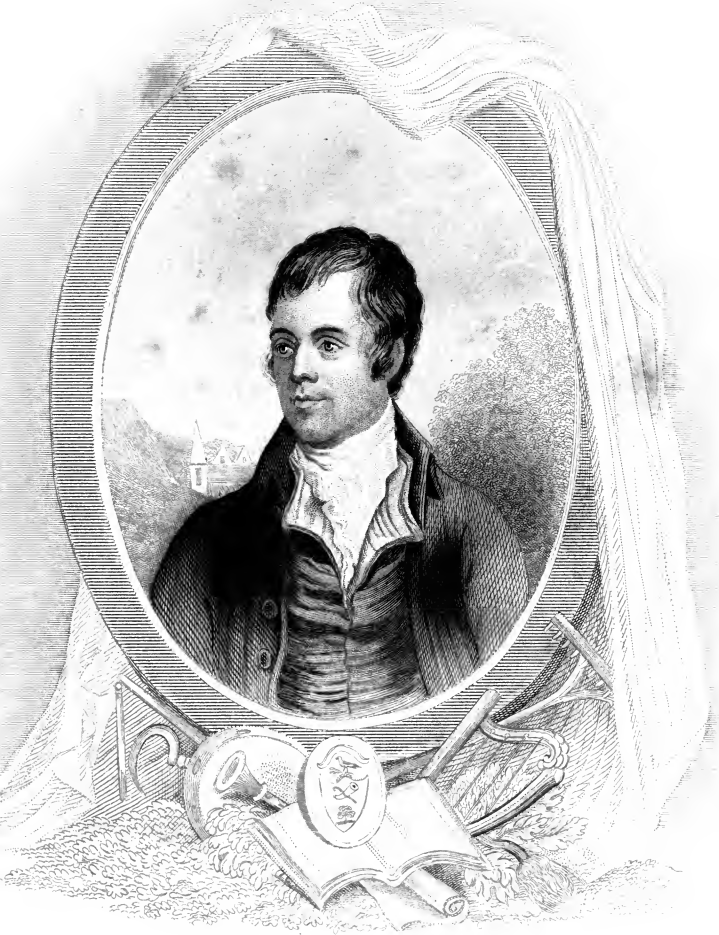
Robert Burns Pic.

TO THE MEMBERS OF THE SOCIETY OF THE SCOTCH BROTHERS